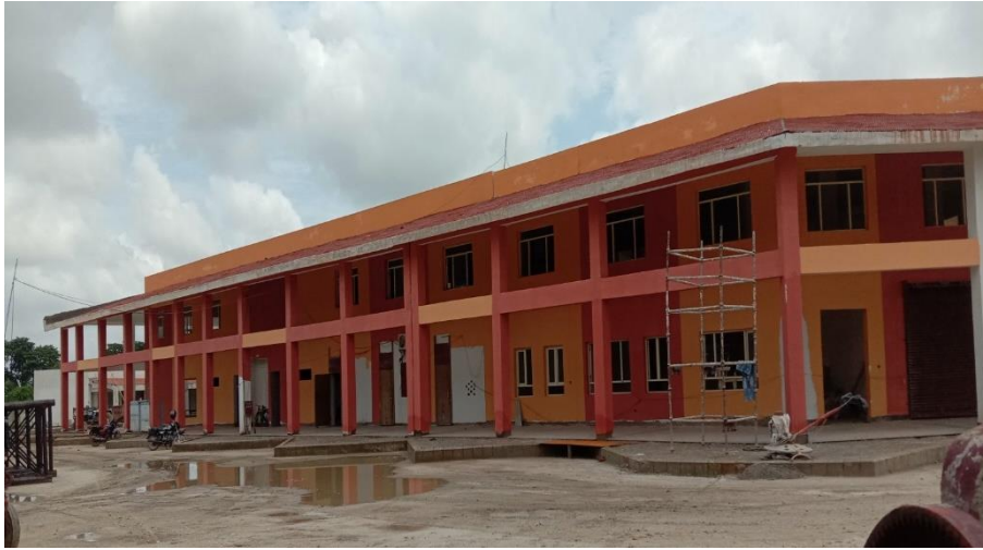
IMAGE: BUS STAND, AYODHYA BYPASS

IMAGES AND SITEMAP OF THE BUS STAND BELOW: