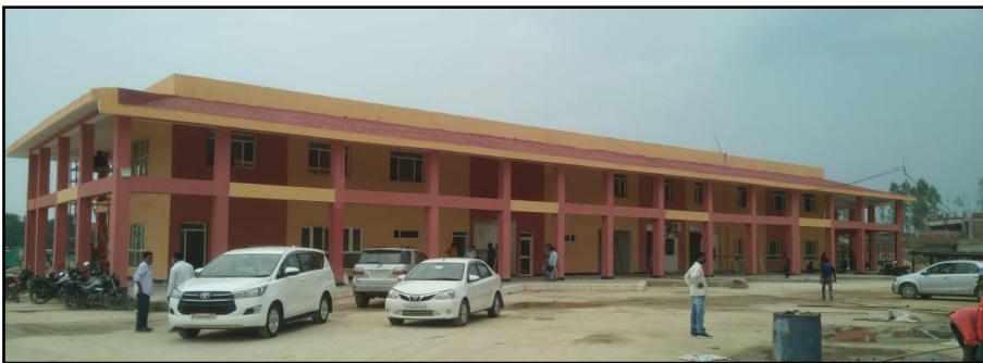
IMAGE: BUS STAND, AYODHYA BYPASS